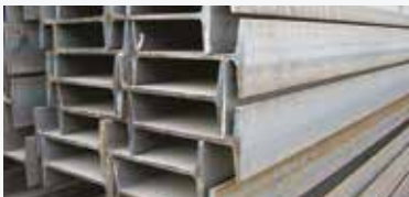
Mild Steel Fabrication

Competitive pricing, world class workmanship, quick turnaround time and prompt delivery – with these key factors also to support our expertise, we believe that we can make all your big dreams come true.