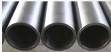
Stainless Steel Fabrication