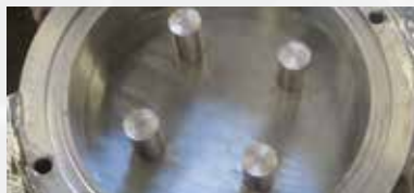
Rubber Mould Manufacturing